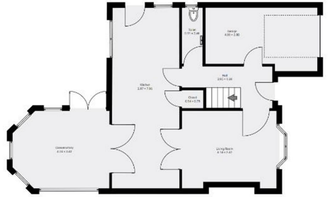
▼ 1st Floor